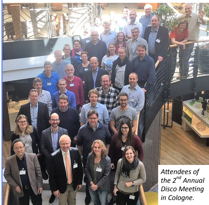
Attendees of the 2 nd Annual DisCo Meeting in Cologne.

There were 49 attendees, representing beneficiaries, the End-User-Group and Associate Group. All partner organisations had oral presentations describing progress during the 2 nd year. This year, parallel sessions were organised for WP 3, 4, and 5, where technical issues and progress were discussed. The issues concerning WP2 (sample preparation and characterisation) were taken up in WP3 and WP4. The work is well underway, with dissolution experiments started on well characterised samples. We are expecting alpha-doped samples to be produced later this year, which is later than