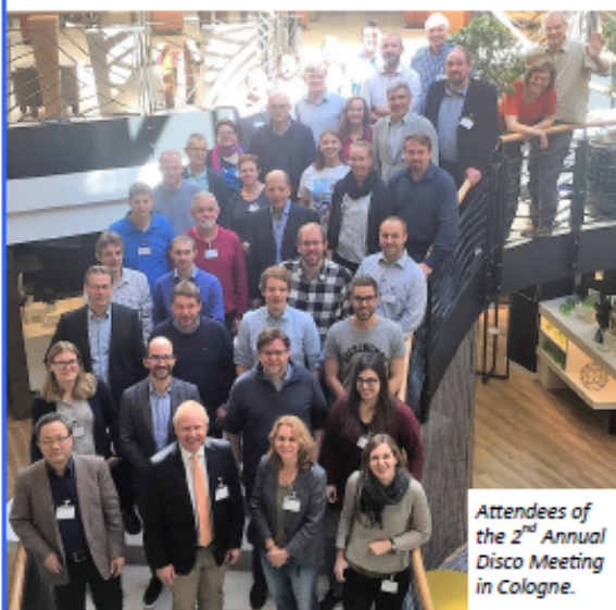
Attendees of the 2 nd Annual DisCo Meeting in Cologne.

The next meeting will be held in Karlsruhe in late April or early May 2020. It will be announced on the project web page.