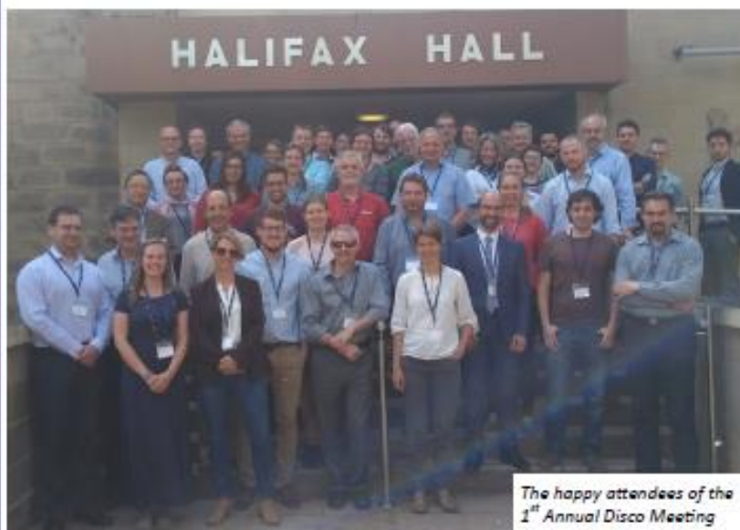
The happy attendees of the 1 st Annual Disco Meeting

This and more will be presented at the 2 nd Annual Meeting, planned for Cologne, Germany.